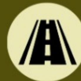
Black Top Road