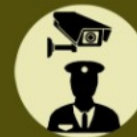
24/7 CCTV & Security