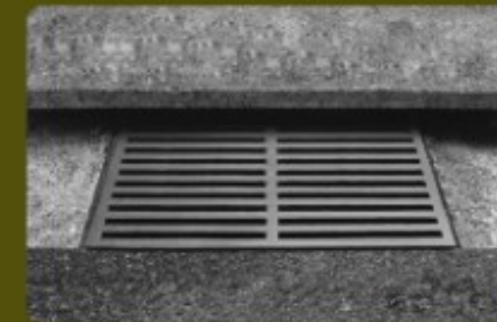
Storm Water Drainage