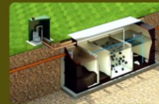
Sewage Treatment Plant (For All Plots)