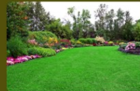
Landscape Green Area