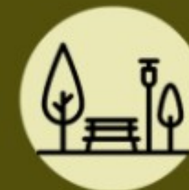
OSR & Amenities