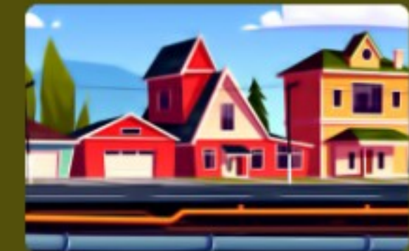
Drinking Water Pipeline