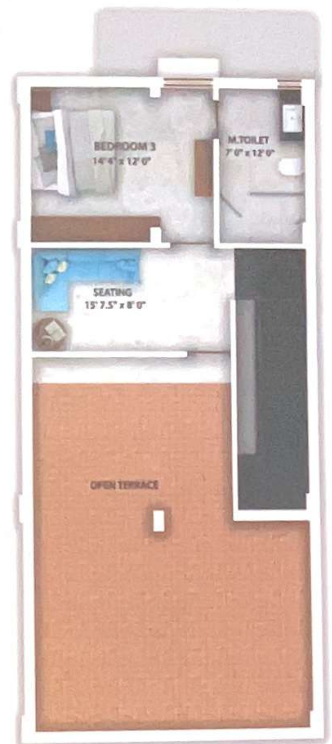
SECOND FLOOR & TERRACE